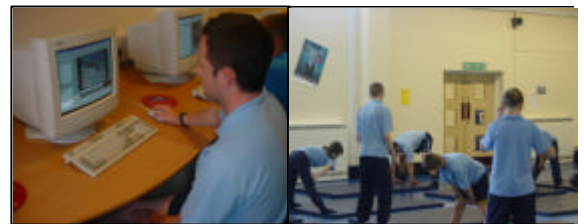
Above left: Teacher training workshop using Dart Trainer. Above right: Year Nine Gymnastics Sports Performance Analysis Lesson.

Extensions to this programme have included the use of mobile equipment, including a laptop loaded with Dart Trainer, DV Cameras and a variety of data logging equipment including timing mats, heart rate monitors and many more sensors to support extension activities in school for the PE curriculum .